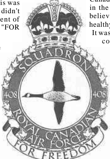
Badge of No.408 (Goose) Squadron.

Other bomber squadron names were chosen to reflect their adoption by specific communities in Canada, such as 405 (Vancouver) Squadron at Gransden Lodge, (the RCAF's contribution to the Pathfinder Group, which was by and large sustained by contributions of elite crews from Six Group), 432 (Leaside, Ontario) at East Moor, and 434 (Bluenose) Squadron at Croft, whose name (and the sponsorship of the Halifax Rotary Club) reflected the maritime heritage of many of the squadron aircrew.